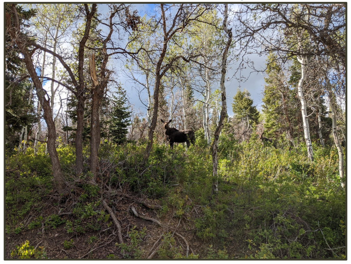
Thanks for participating!